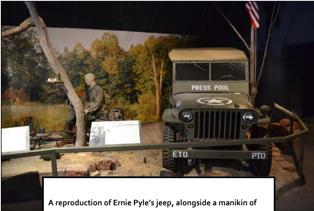
A reproduction of Ernie Pyle's jeep, alongside a manikin of Ernie in a bivouac site

The museum itself was cool, and featured diorama exhibits of Ernie Pyle's adventures in Europe and the Pacific. There were also excerpts from his writings—if you'll permit me a moment to editorialize, I'll tell you he was the greatest of the WW2 correspondents...If you get a chance to visit the Ernie Pyle Home and Museum, definitely do it, you won't be sorry!