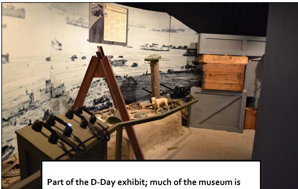
Part of the D-Day exhibit; much of the museum is interactive.