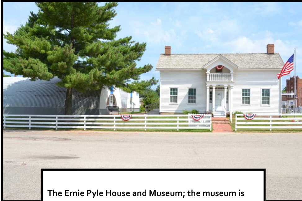
The Ernie Pyle House and Museum; the museum is contained in the two Quonset huts in back

Last month, while participating in the excellent Kennekuk Park event, I took a slight detour to visit the Ernie Pyle Home and Museum, located in Dana, Indiana. Unlike most of my museum reviews, I will not bother to give you the exact address: if you can find Dana, Indiana, you can find Ernie's house!