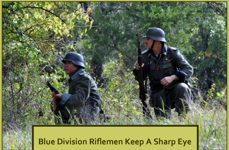
Blue Division Riflemen Keep A Sharp Eye Out For Soviet Infiltrators.