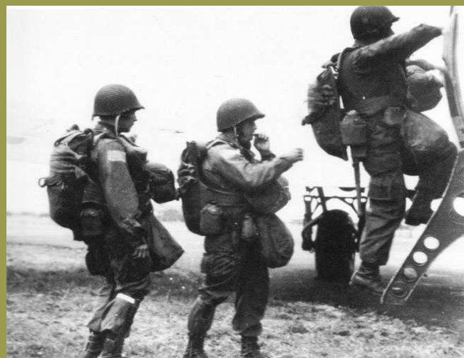
Rigger pouches can be seen on the trooper entering the plane, as well as on the trooper in the middle.