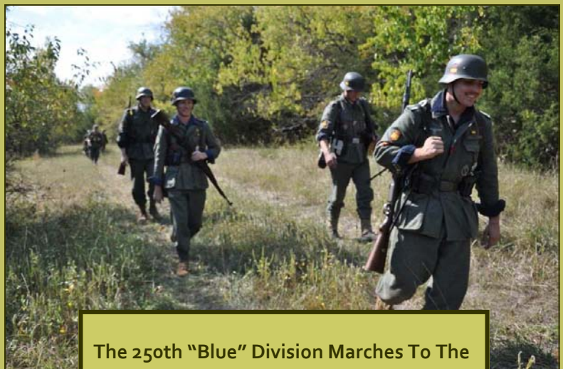
The 250th "Blue" Division Marches To The Front.