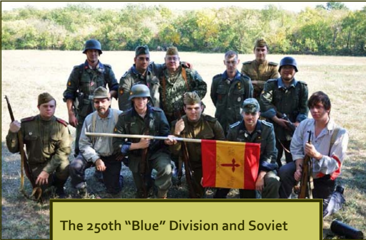
The 250th "Blue" Division and Soviet Foes