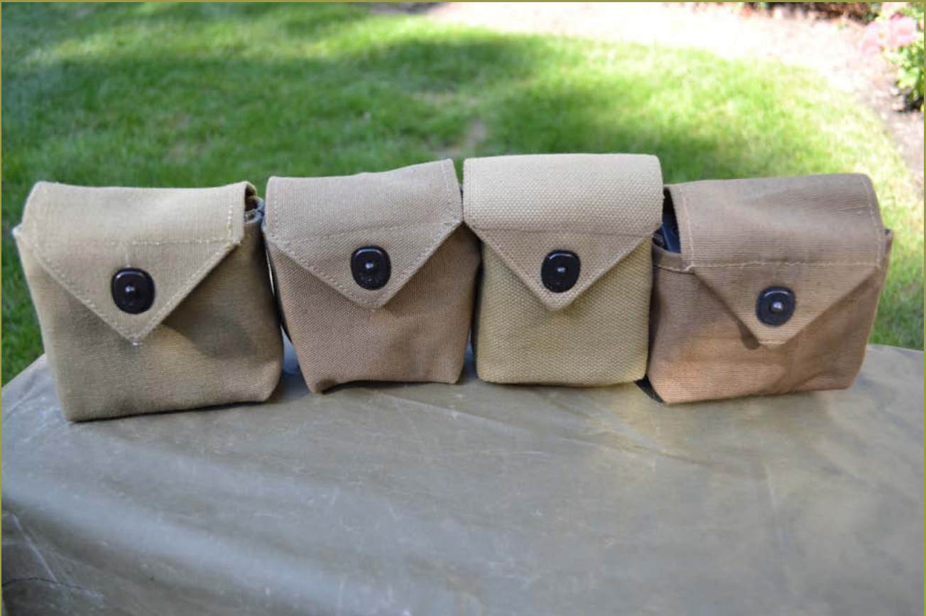
Left To Right: WWII Impressions; At The Front; Service of Supply; What Price Glory.

In the end, I purchased more of the World War Two Impressions rigger pouches for my impression. They were the closest in appearance to the originals (as seen in photos); and they were the correct color and materials. A strong second in my mind was the At The Front; I would advise any member of my unit to steer clear of the Service of Supply and What Price Glory rigger pouches.