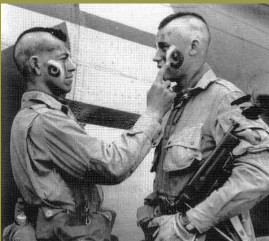
Rigger pouches can clearly be seen on the paratrooper to the left.

There was a downside to the rigger pouches, seeing as all four clips were retained by the same flap. So when the paratrooper removed a clip, he had to be sure to re-snap the pouch. If not, there was a very real danger that the extra clips would fall out and be lost. This might be the reason that popular use of the rigger pouch was relatively short lived, and a downward slope at that. In viewing pictures of the 82nd Airborne Division, one can see that the rigger pouches were used extensively during the Sicily/Operation Husky campaign, as well as during the Paestum jump in support of Operation Avalanche. By Normandy, however, photographic evidence shows that the cartridge belt was coming into wider use, and rigger pouch use was falling by the wayside. Finally, by Operation Market Garden, I was unable to find any photographs of the 82nd Airborne (or the 101st A/B Division) using rigger pouches. This is especially of interest to those who reenact paratrooper, as it can be seen that there is no “one size fits all” airborne impression; rather one must pay particular attention to minor details such as these.