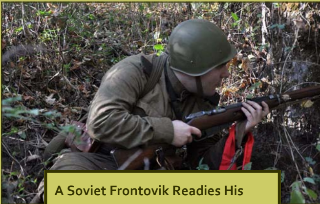
A Soviet Frontovik Readies His Weapon.