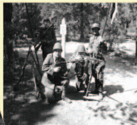
12 TH PODOLIAN LANCERS, 3 RD CARPATHIAN DIVISION "Guarding the Polish border"