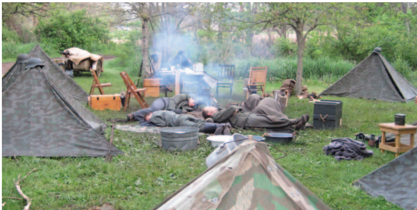
German 709th Infanterie Division Camp

Hundreds of extremely skilled reenactors come out to this event every year and bring outstanding collections of equipment. It gets a bit hectic when the public arrives in everyone's camps. My favorite time to tour the camps is at dawn, before the public arrives. You can truly feel like you have taken a step back in time. While most focus on the Battle reenactment ... the true nature of all the efforts put into this event by the reenactors can be seen in the camps.