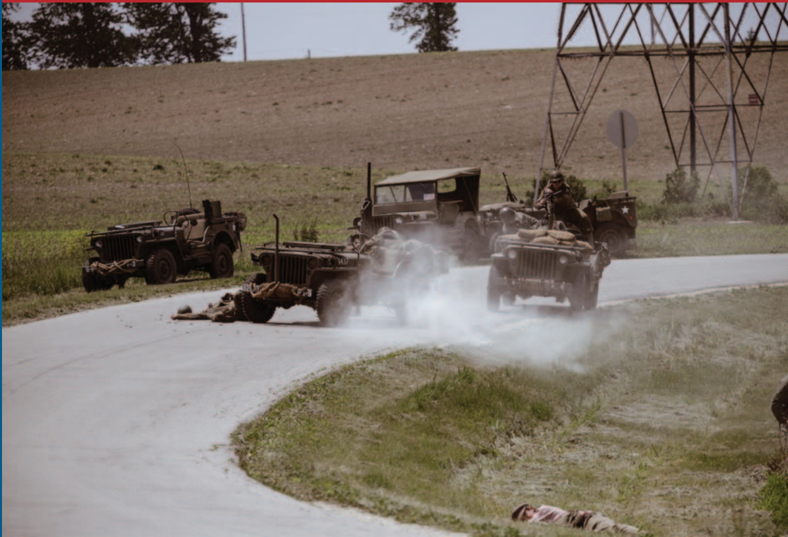
Ambush at Union 2012