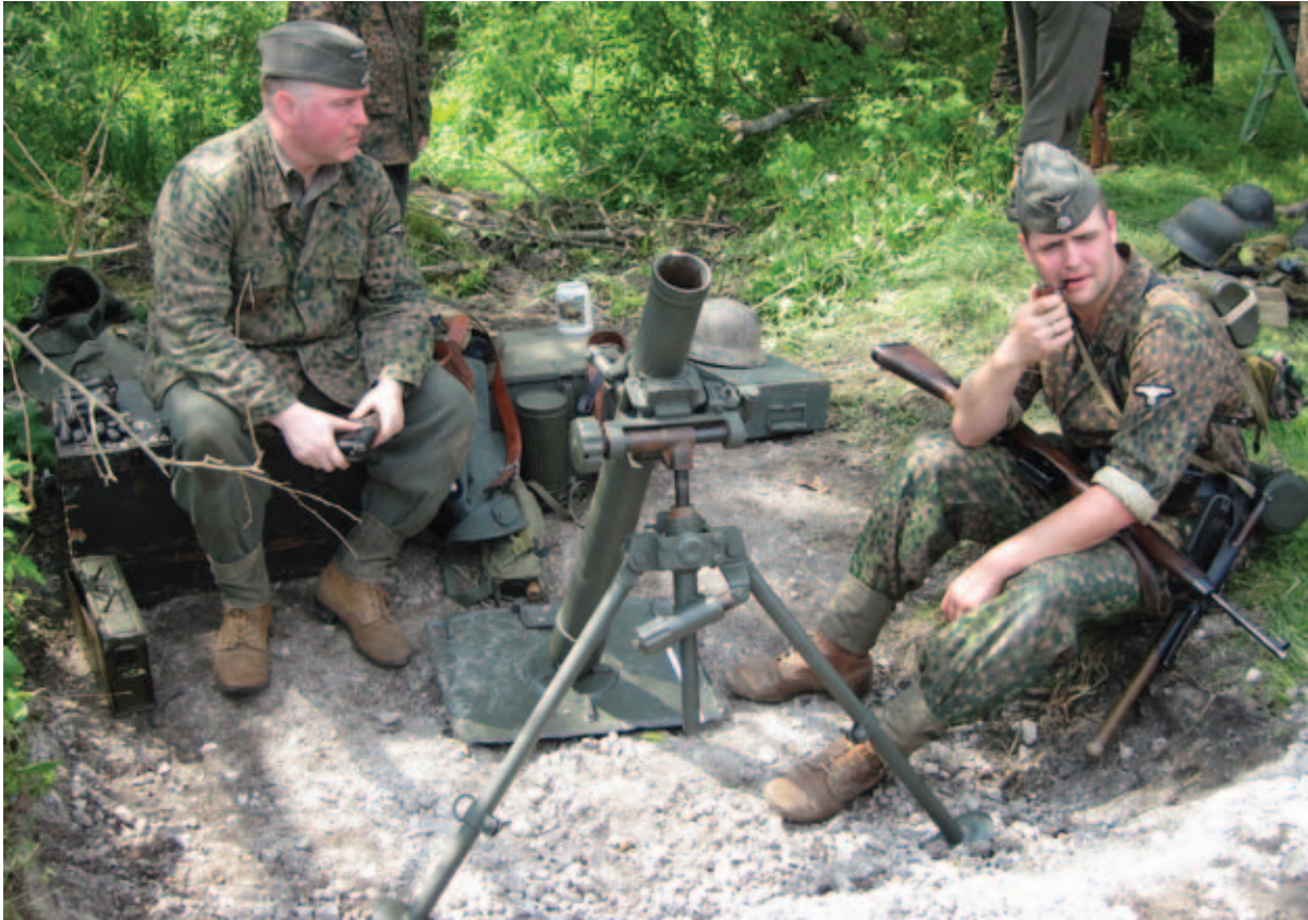
5th SS Wiking Motor Team at Rest and in Action