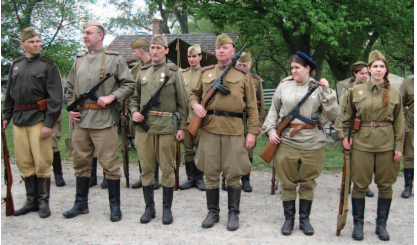
Russian 95th Rifles