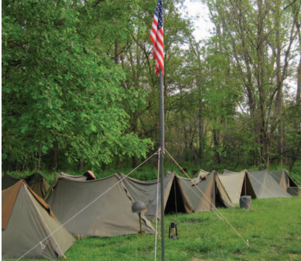
Event Co-Host: US 9th Infantry Division Camp