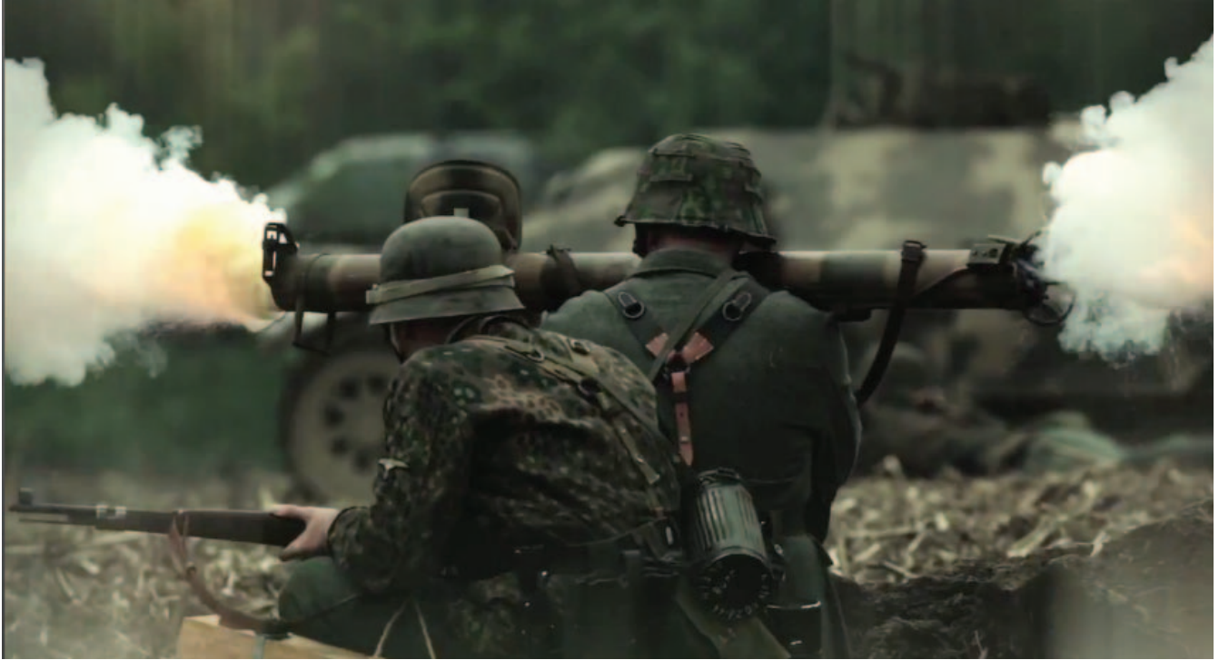
5th SS Wiking's Panzershreck takes on the 70th Tank Battalion Stewart Tank.