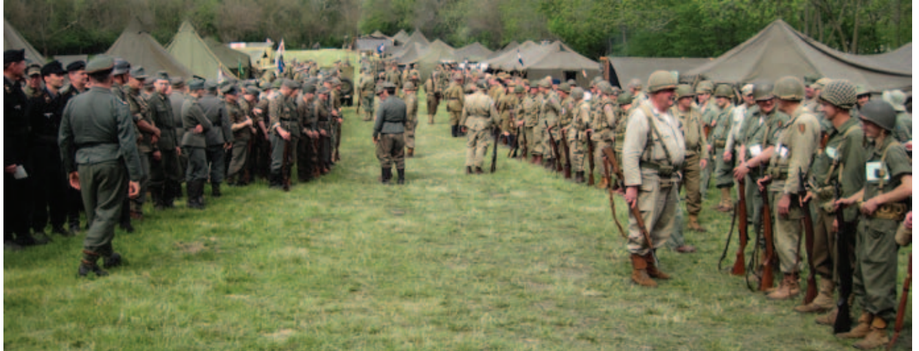
S&A Saturday Morning