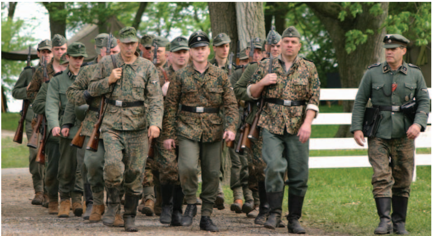
5th SS Wiking