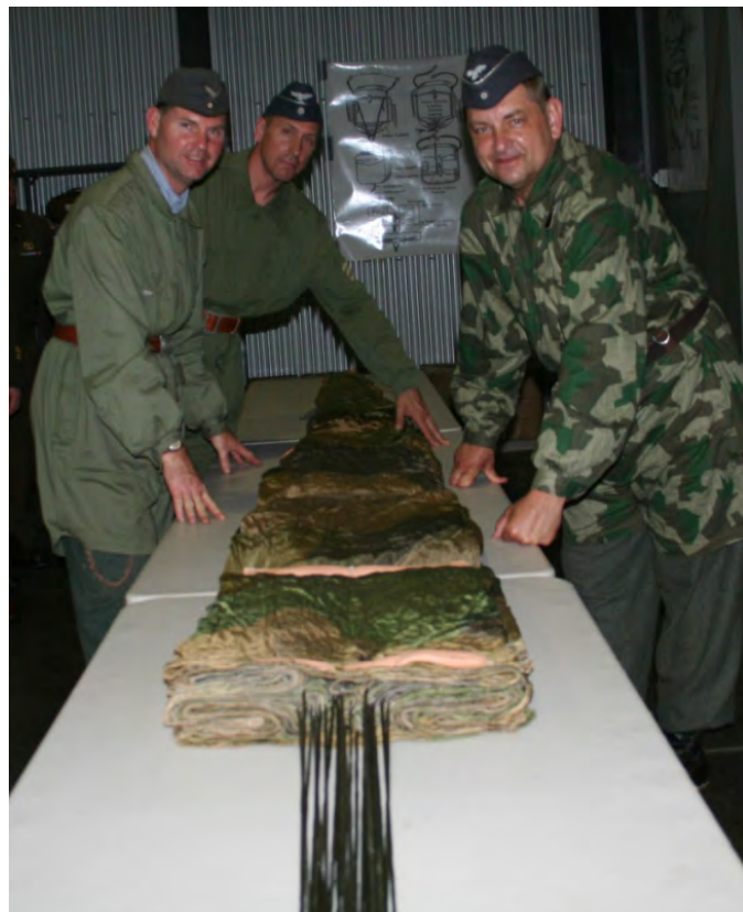
(Parachute Packing Training)