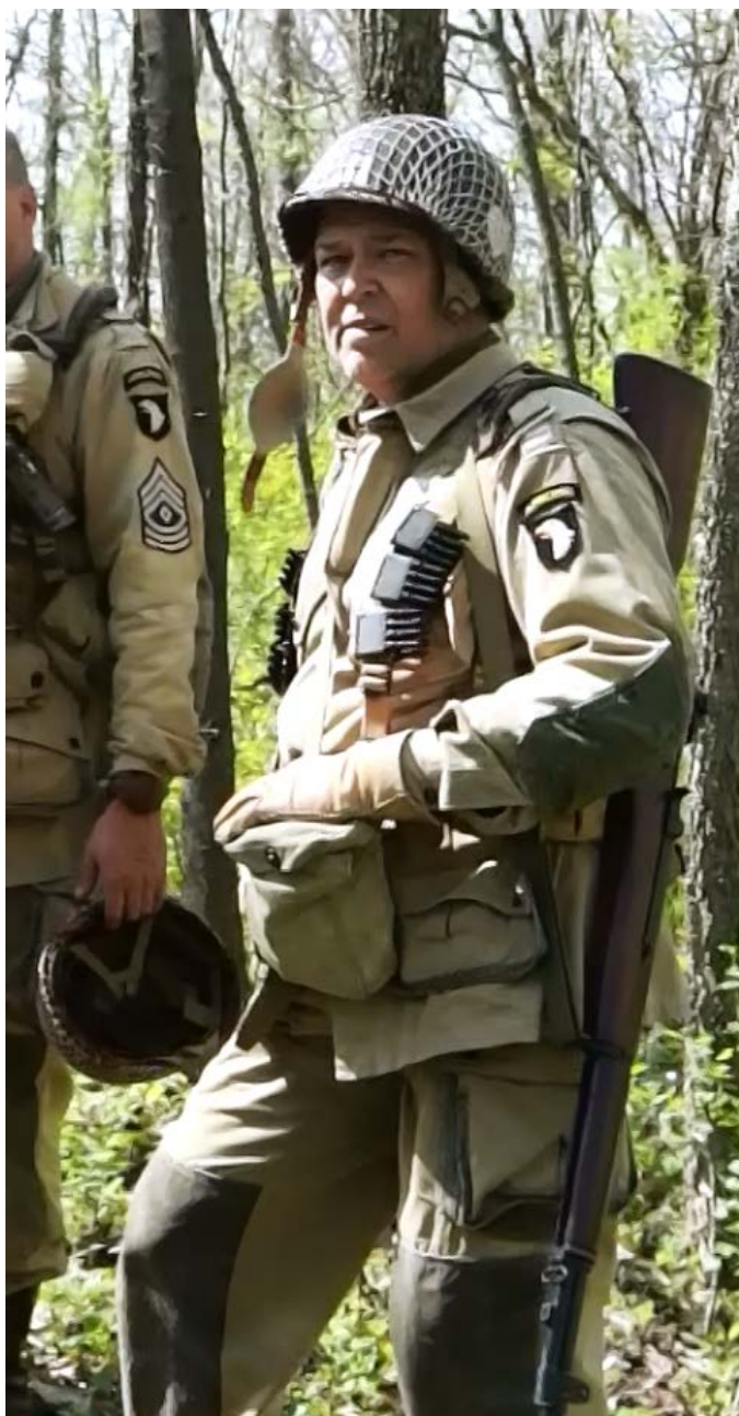
My Letter of Intent for Allied Representative