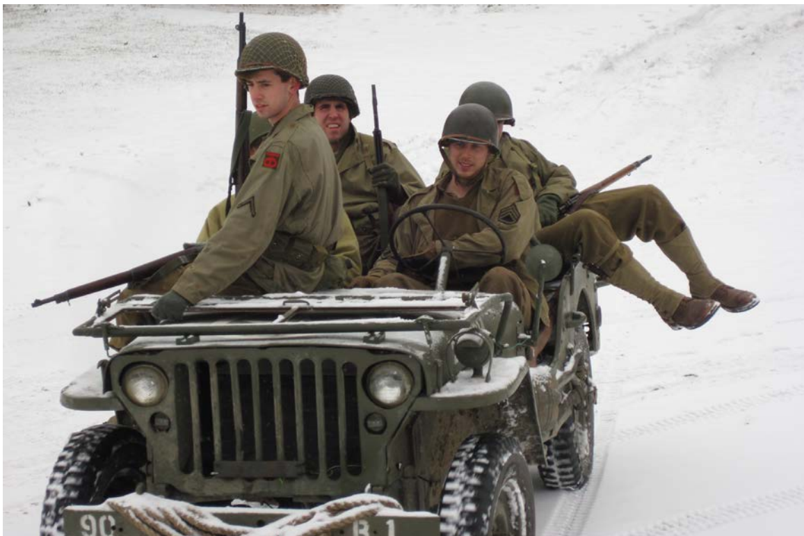
Stone House Tactical February 2011.