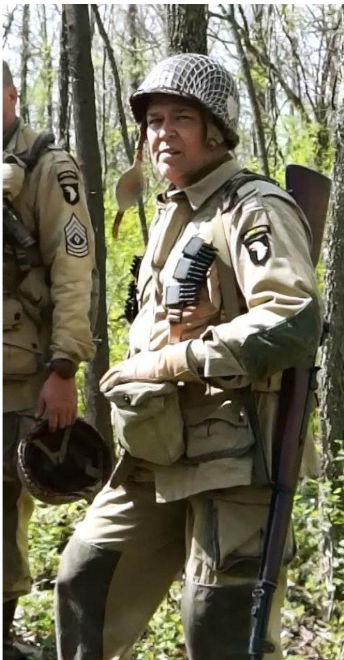
My Letter of Intent for Allied Representative