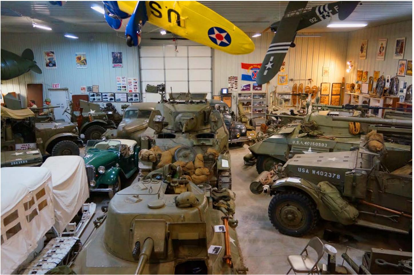
Roberts Armory Rochelle, Illinois

WWII HISTORICAL RE-ENACTMENT SOCIETY Inc.