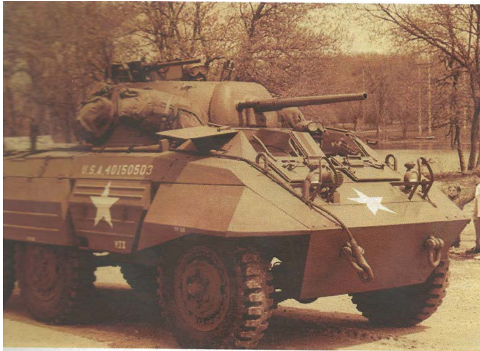
M8 light armored car, Geneva IL, May 1996