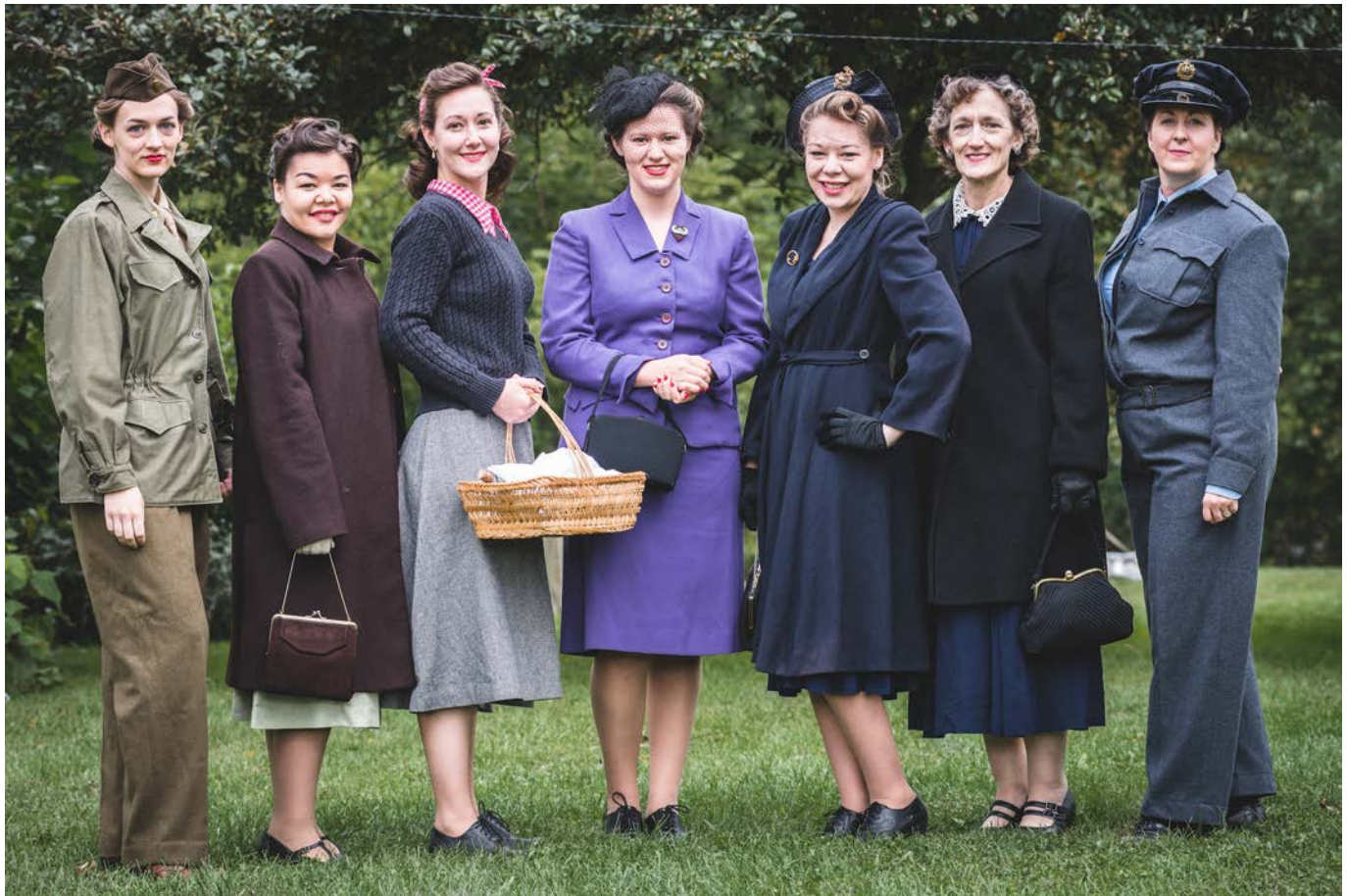
from the Rockford ILL WW2 Event