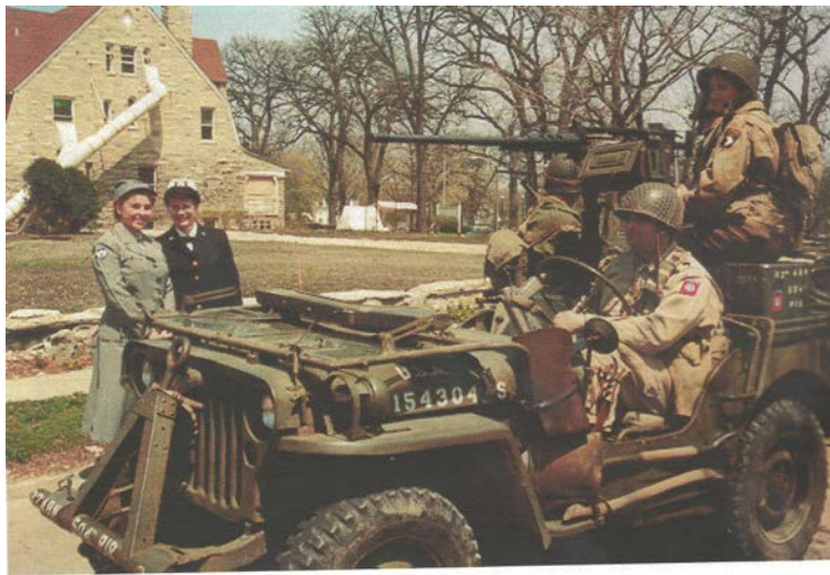
Airborne unit jeep, Geneva IL, May 1996