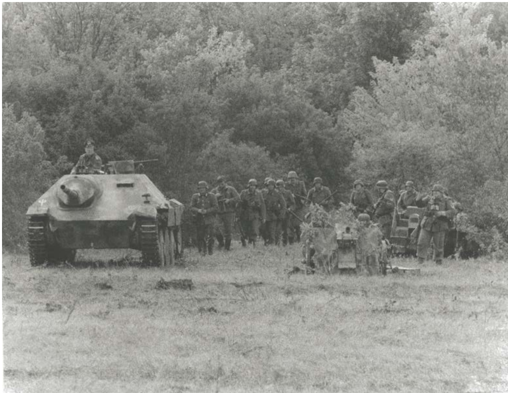
Rockford 2013 Event Photos By: Jim Meldrum - World Was 2 HRS Press Corps