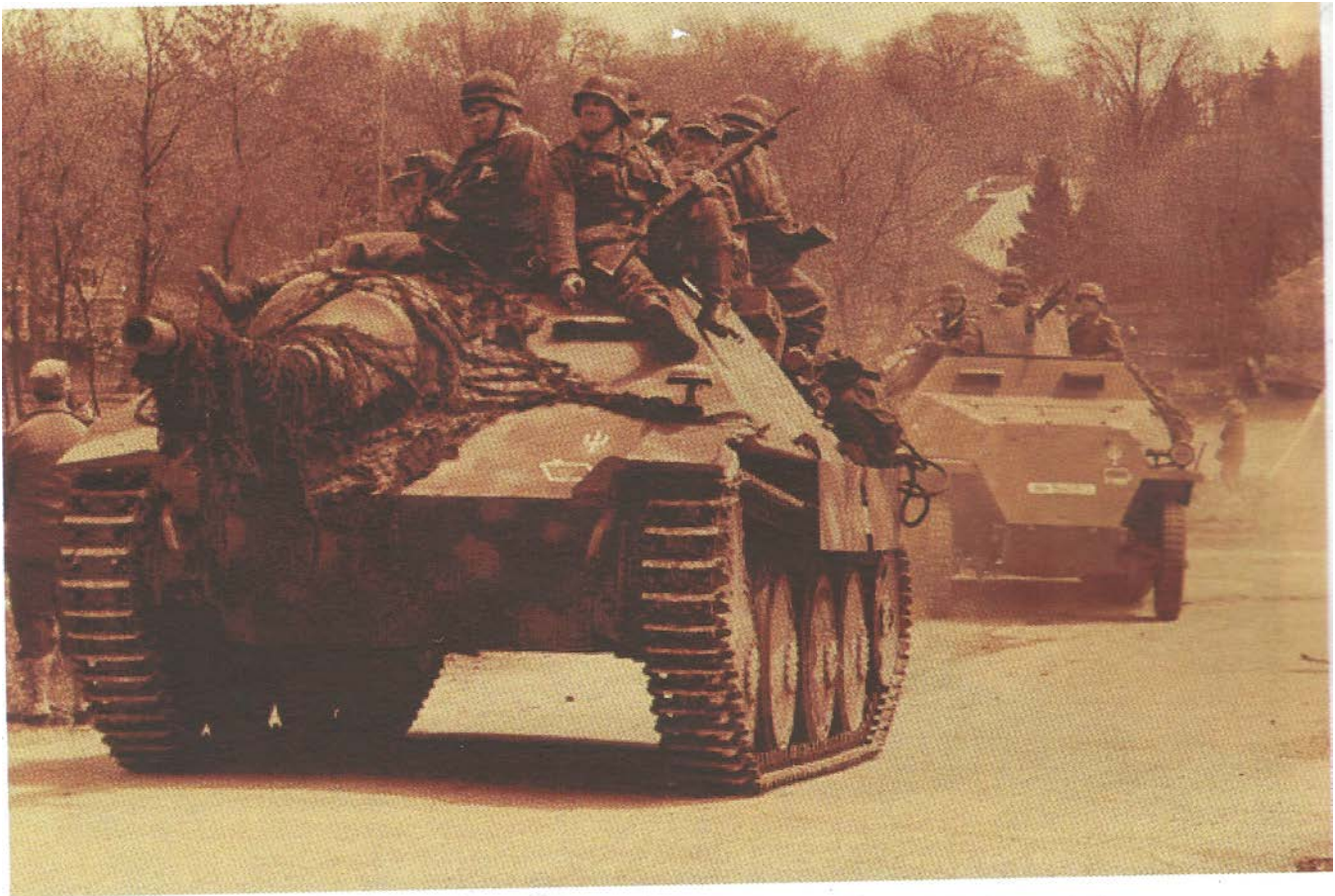
German armored unit, Geneva IL, May 1996

This book is a compilation of photographs taken from World War 2 reenactments that took place in the Midwest from 1990 to 2003. The photographs are a pictorial history of reenactors and their participation in an endeavor to keep the memory of World War 2 Veterans alive.