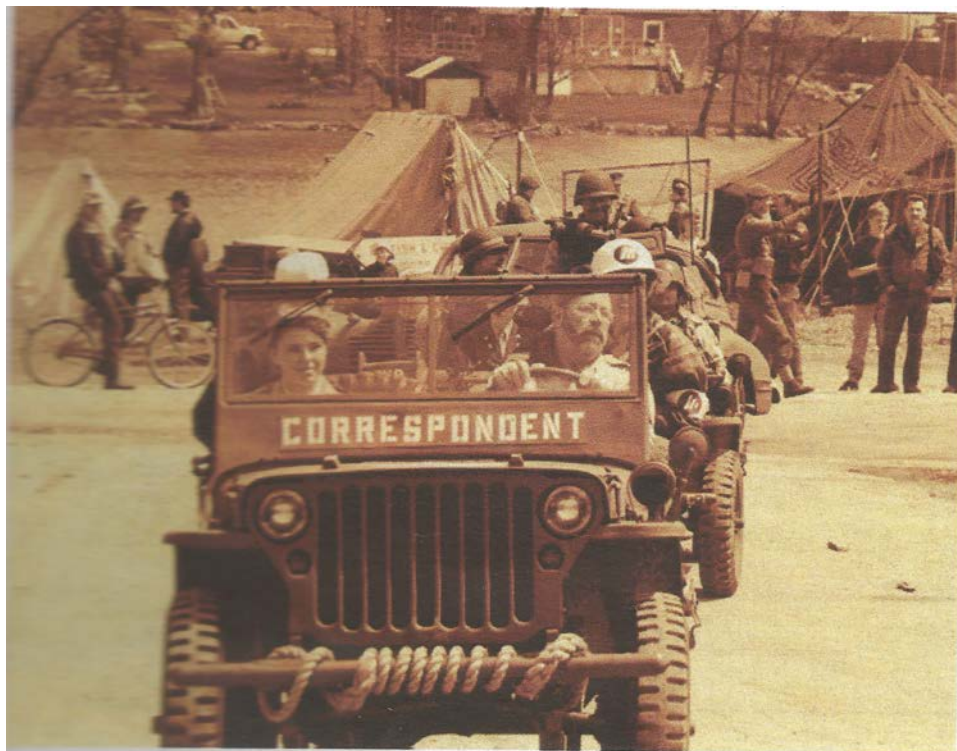
Correspondent picks up the "tomato," Geneva IL, May 1996