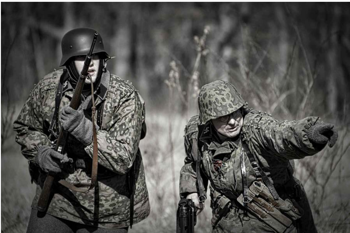
Encirclement Of Berlin Tactical 2016