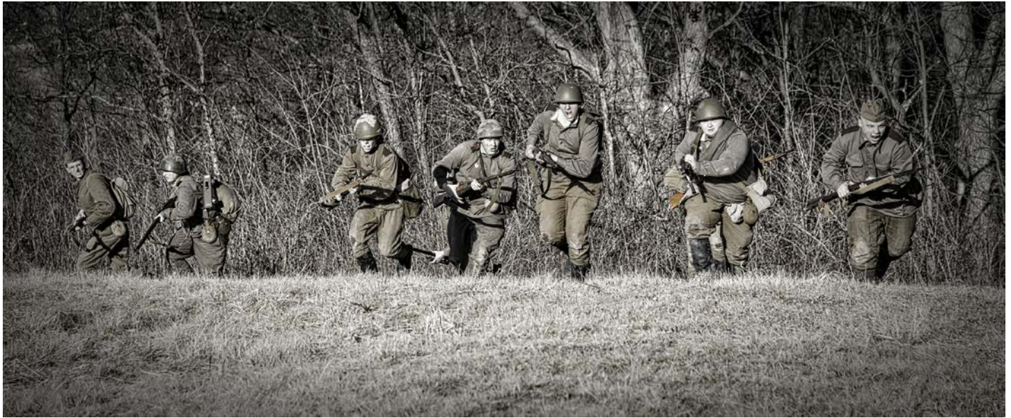
Encirclement Of Berlin Tactical 2016