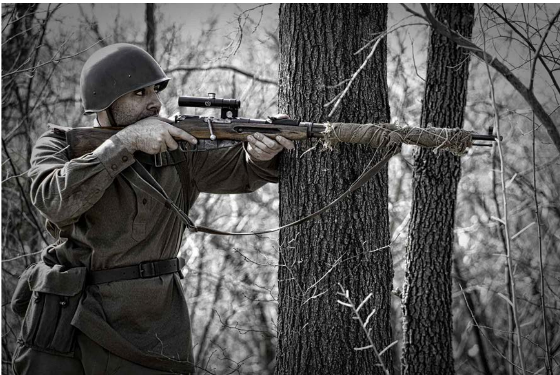
Encirclement Of Berlin Tactical 2016