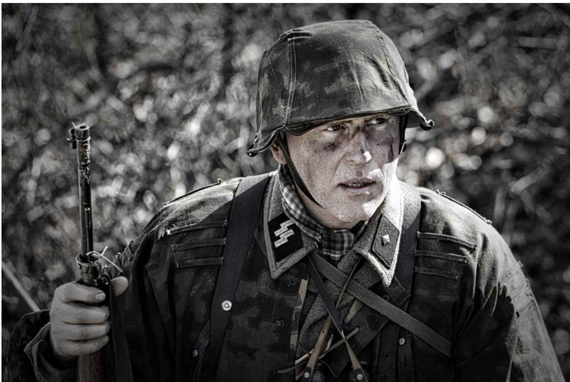
Encirclement Of Berlin Tactical 2016