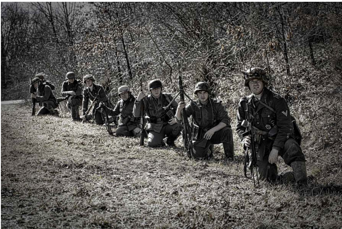
Encirclement Of Berlin Tactical 2016