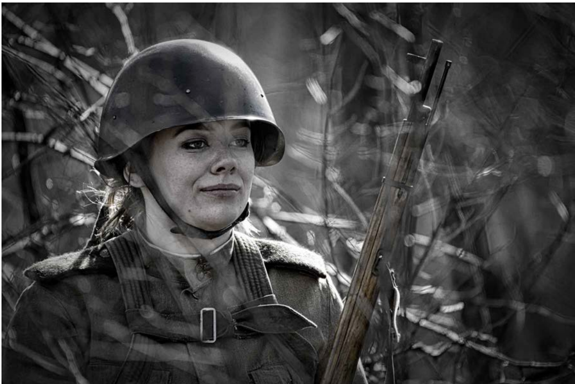
Encirclement Of Berlin Tactical 2016