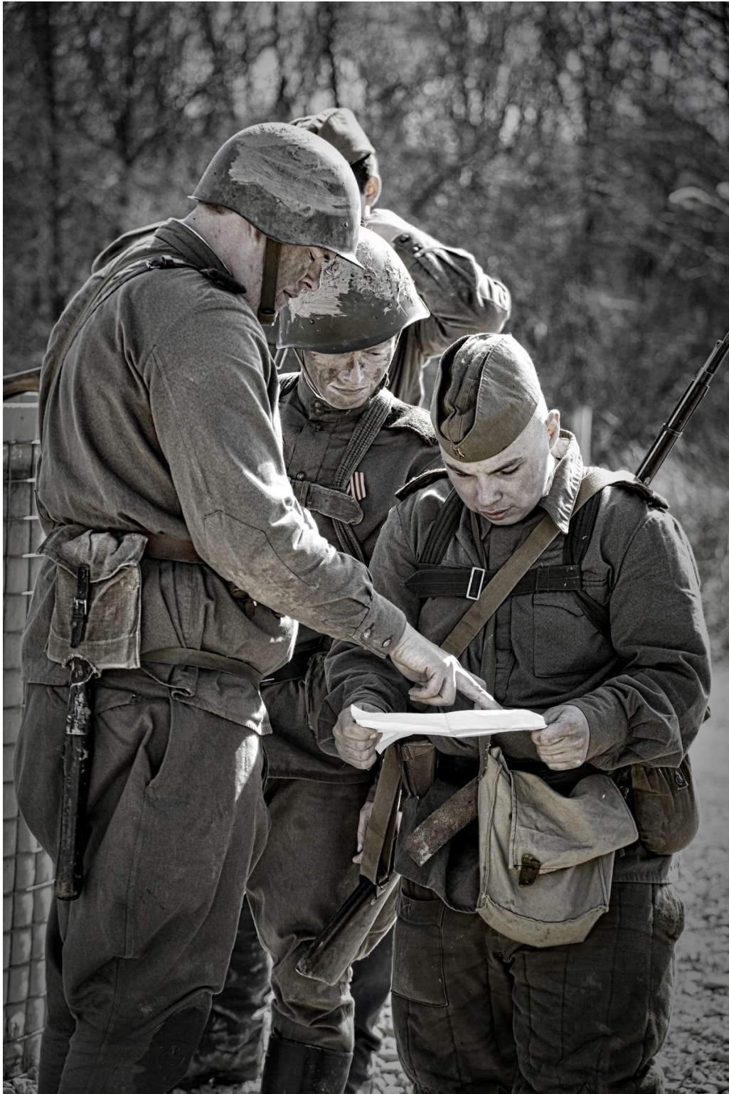
Encirclement Of Berlin Tactical 2016