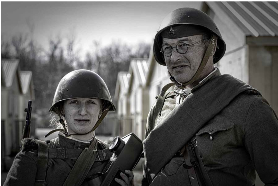
Encirclement Of Berlin Tactical 2016 Photos By Piotr Krawerenda - WW2 HRS Press Corps