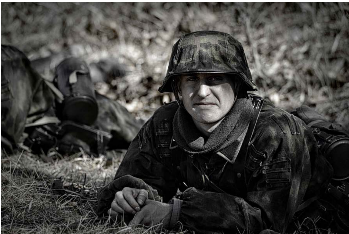
Encirclement Of Berlin Tactical 2016