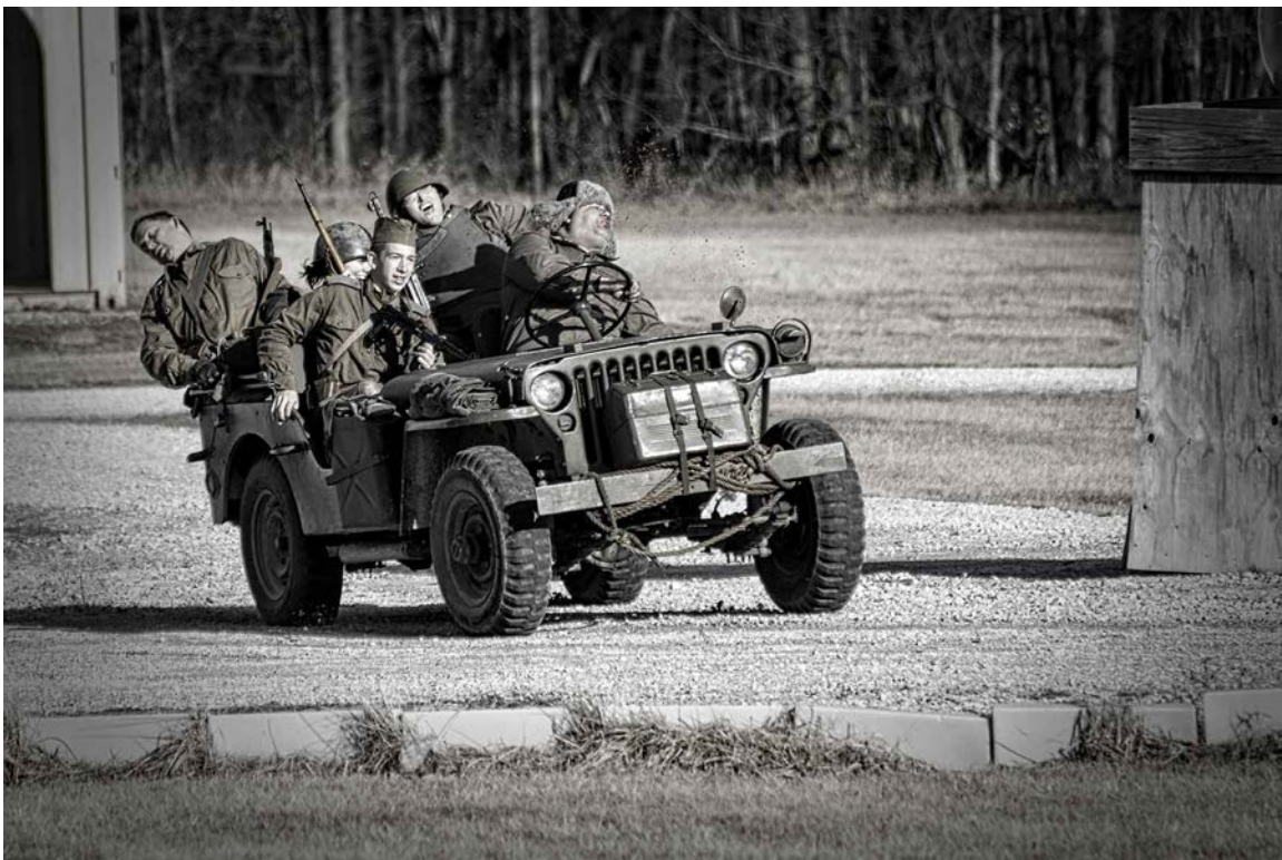
Encirclement Of Berlin Tactical 2016