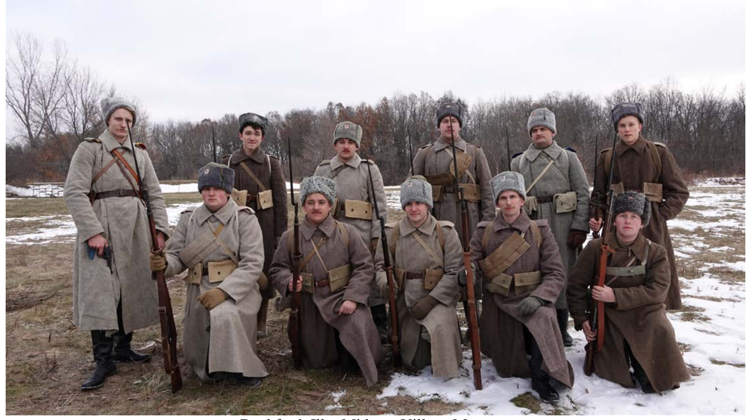
Rockford, Ill – Midway Village Museum

Russians in the WW1 Battlefield Trench <a href="https://www.youtube.com/watch?v=e6TzHBYDzxA">https://www.youtube.com/watch?v=e6TzHBYDzxA</a>