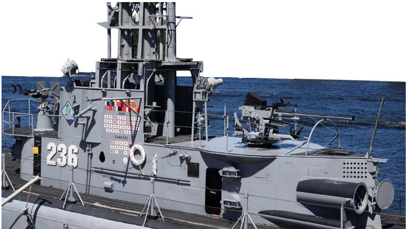
Muskegon, Michigan July 2018