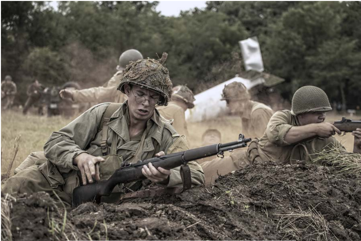
September 2018 Lockport, Illinois