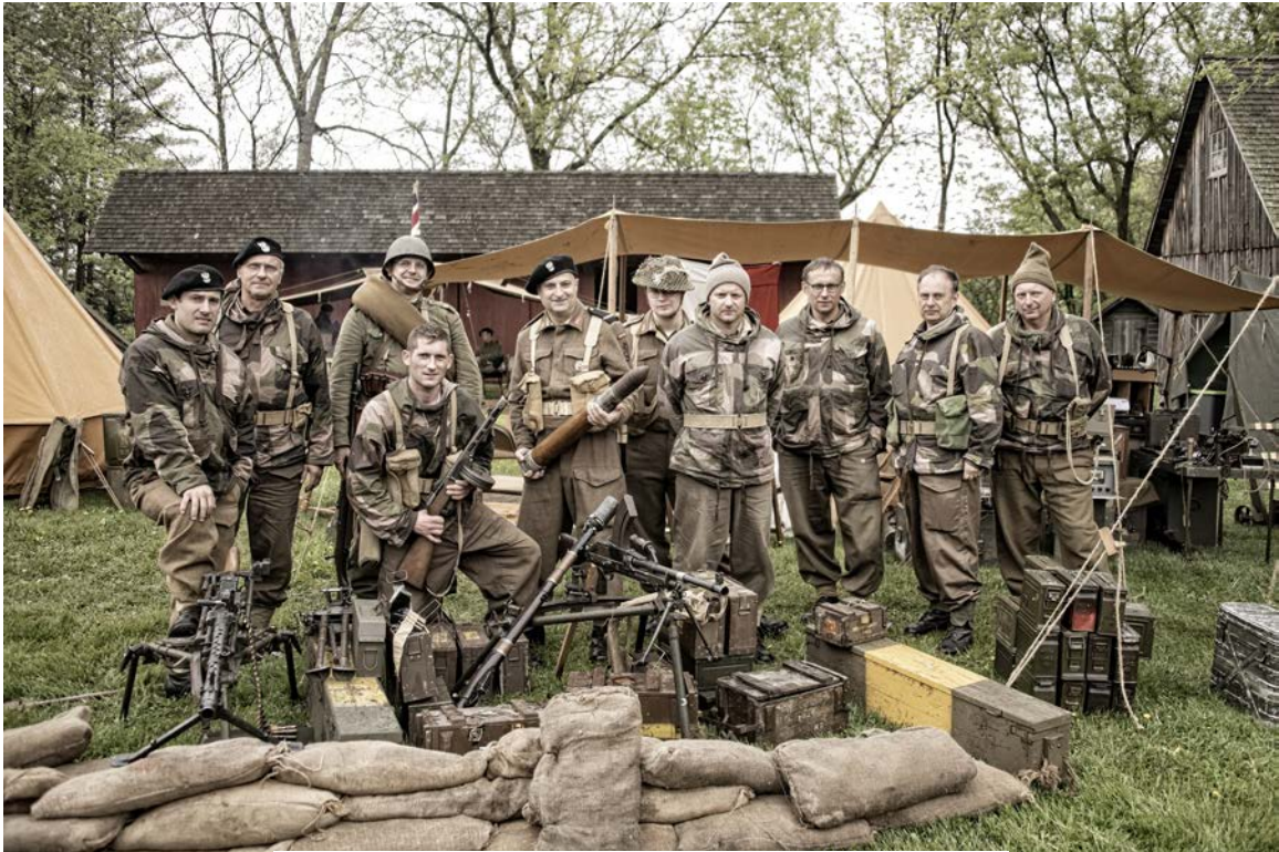
May 2018 Saukville, Wisconsin