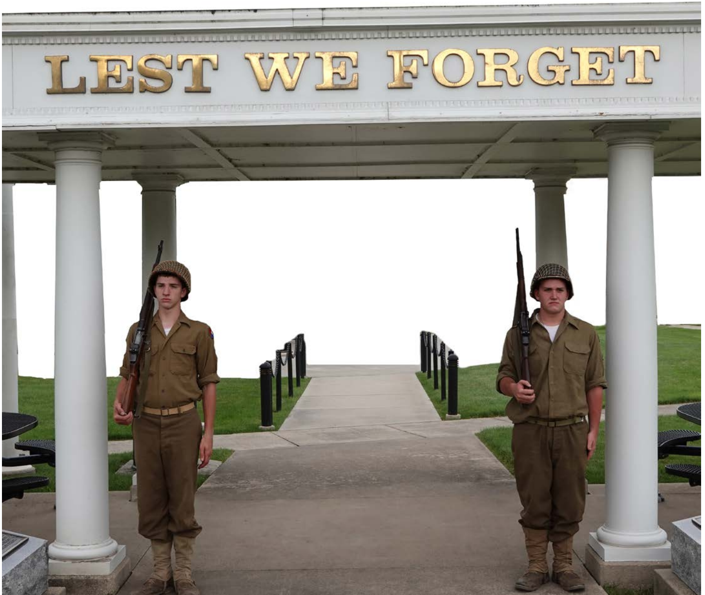
Dixon, Illinois June 2018