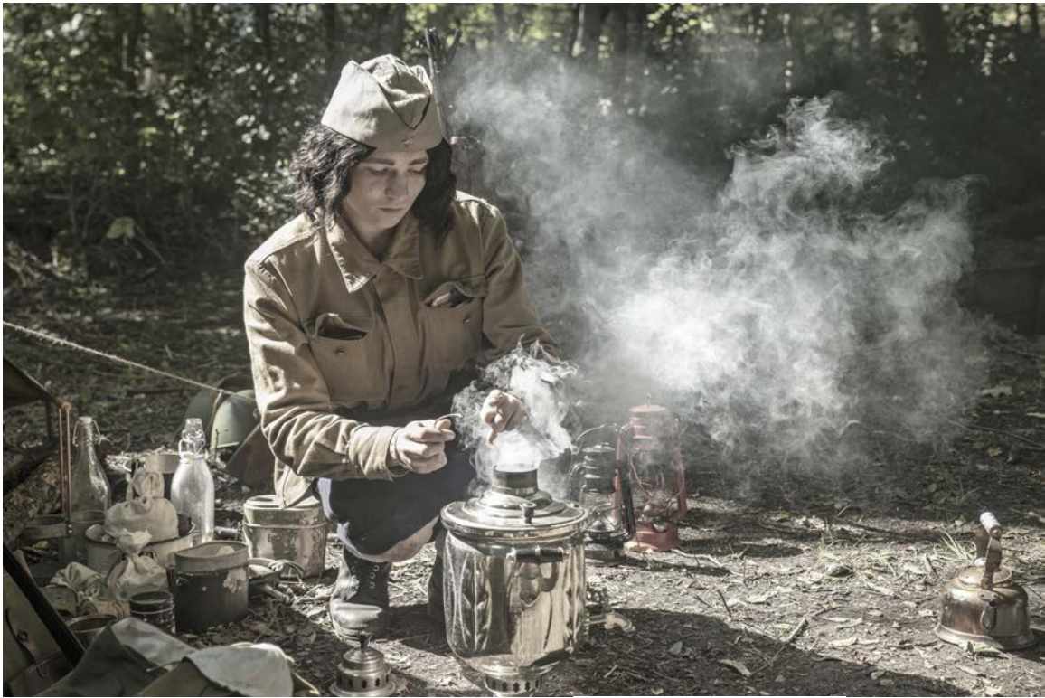
Rockford, Illinois September 2018