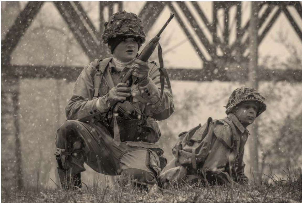
April 2019 South Elgin, Illinois