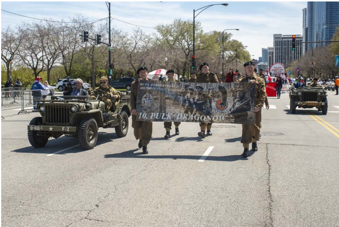
Chicago, Illinois May 2019