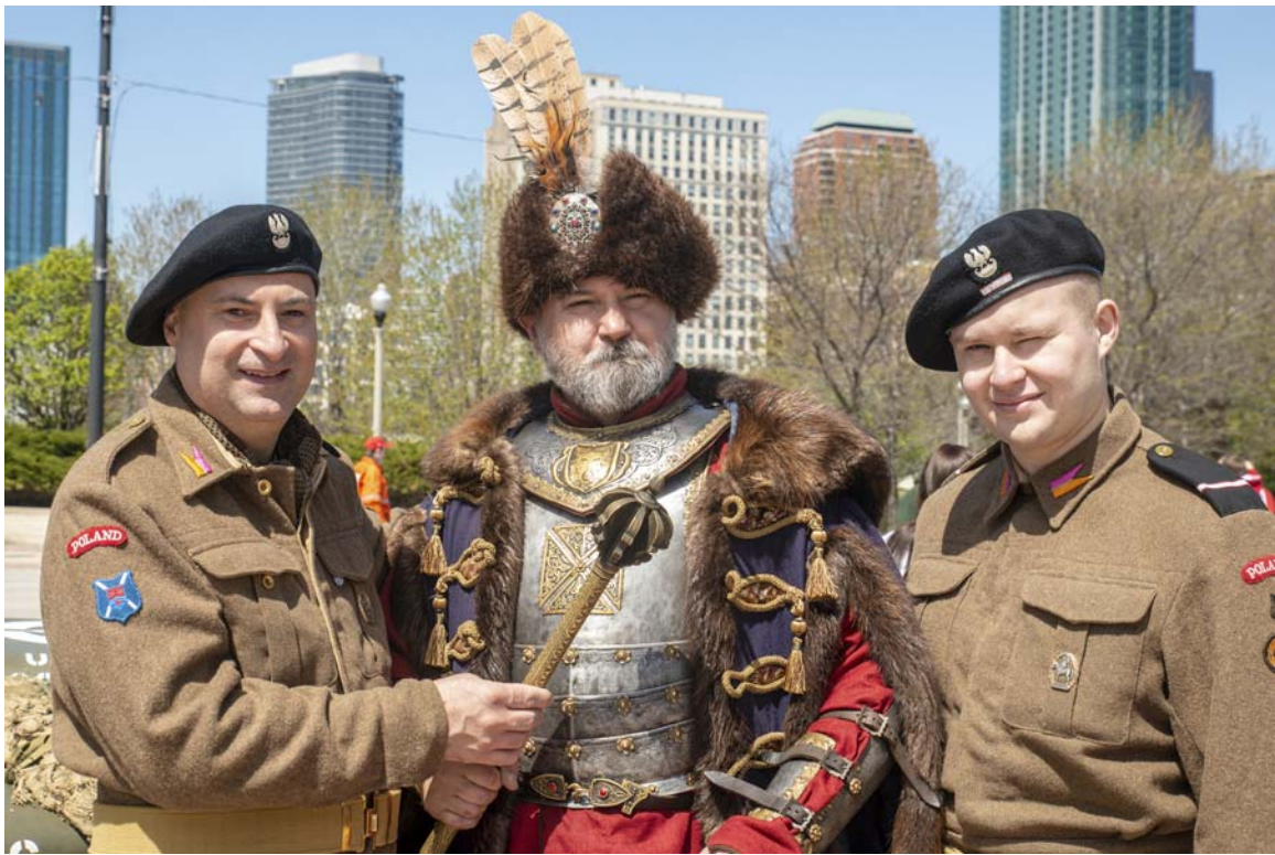
Chicago, Illinois May 2019