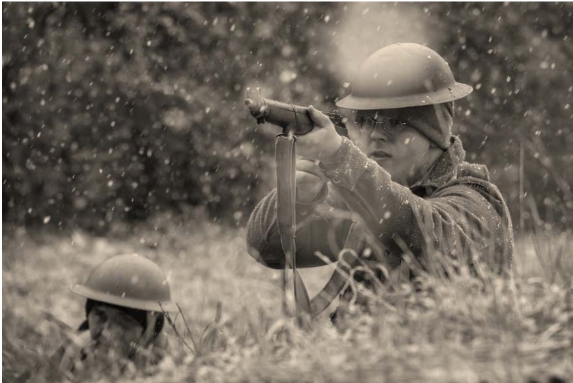
South Elgin, Illinois April 2019