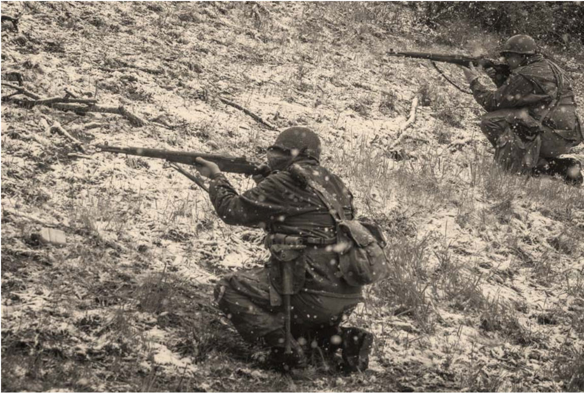
South Elgin, Illinois April 2019