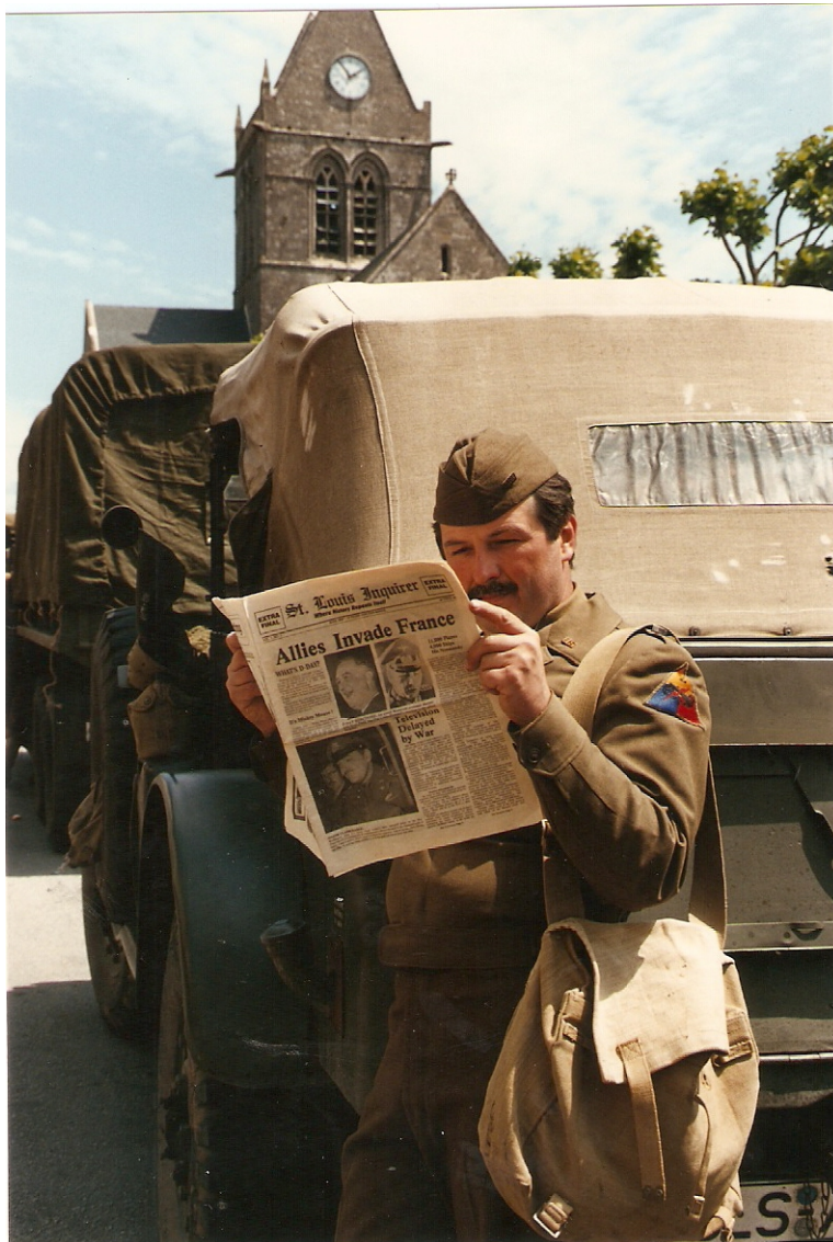
June 5, 1994, St. Mer Eglise, Normandie from my book, A BRIDGE TO TIME, A Re-enactor's Journey (with permission).