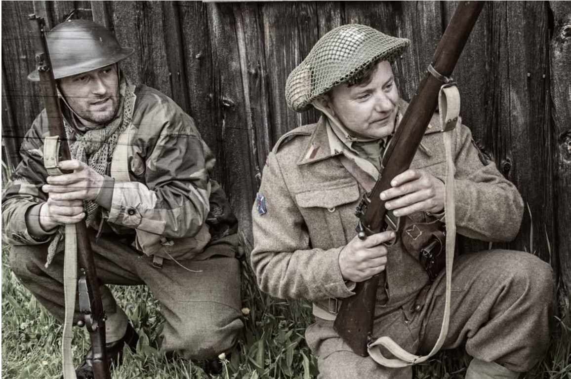
May 2019 Saukville, WI