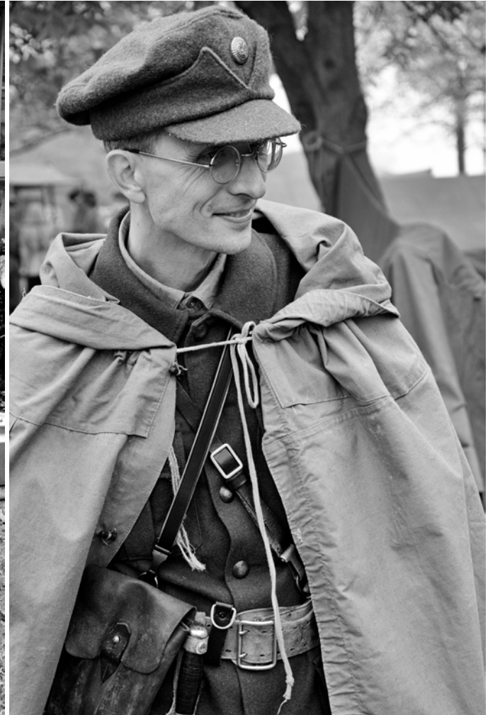
May 2019 Saukville, WI