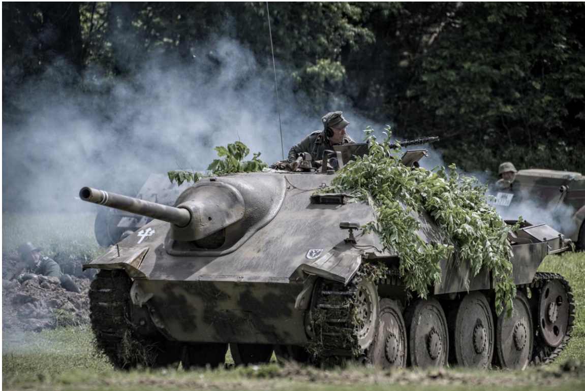
June 2019 Dixon, ILL