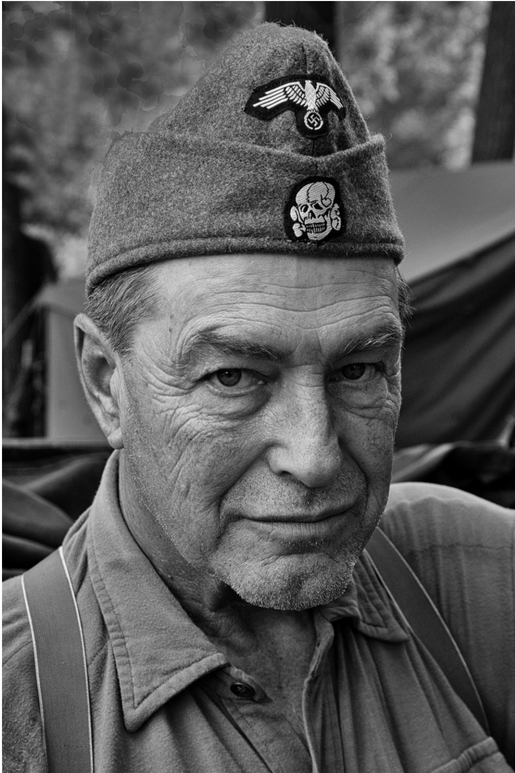
June 2019 Dixon, ILL