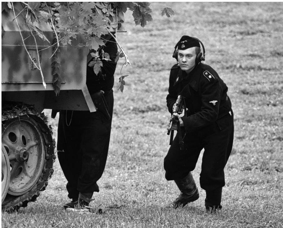
June 2019 Dixon, ILL