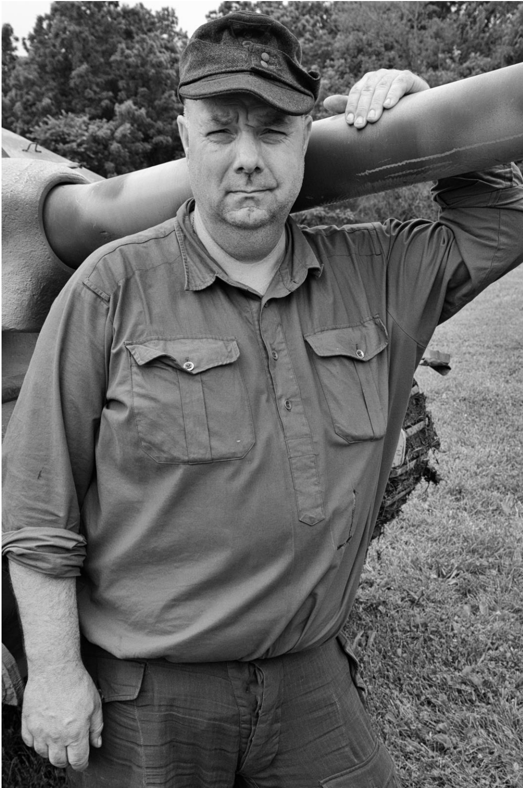
June 2019 Dixon, ILL