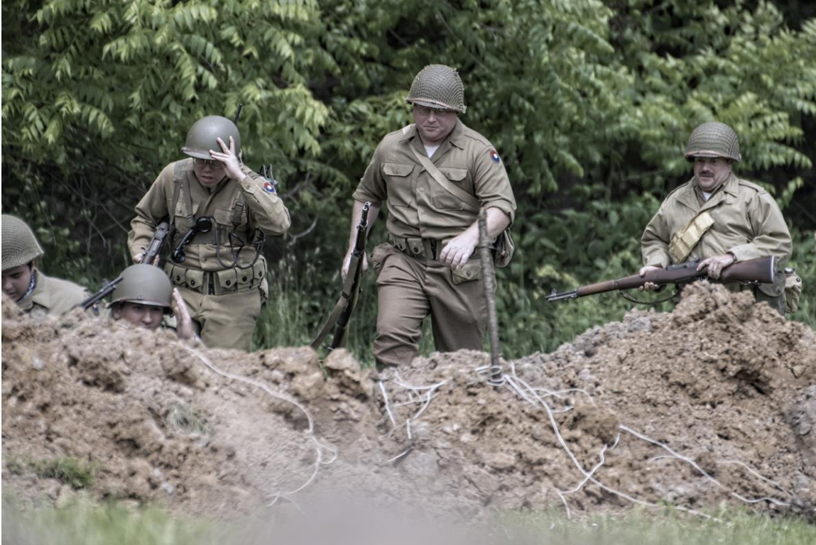
June 2019 Dixon , ILL