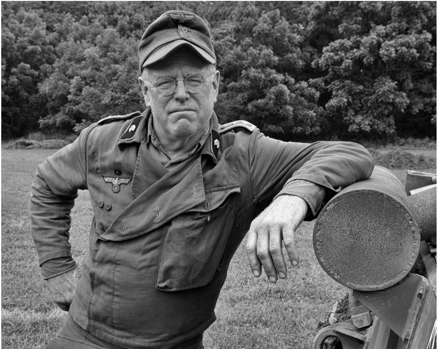
June 2019 Dixon, ILL