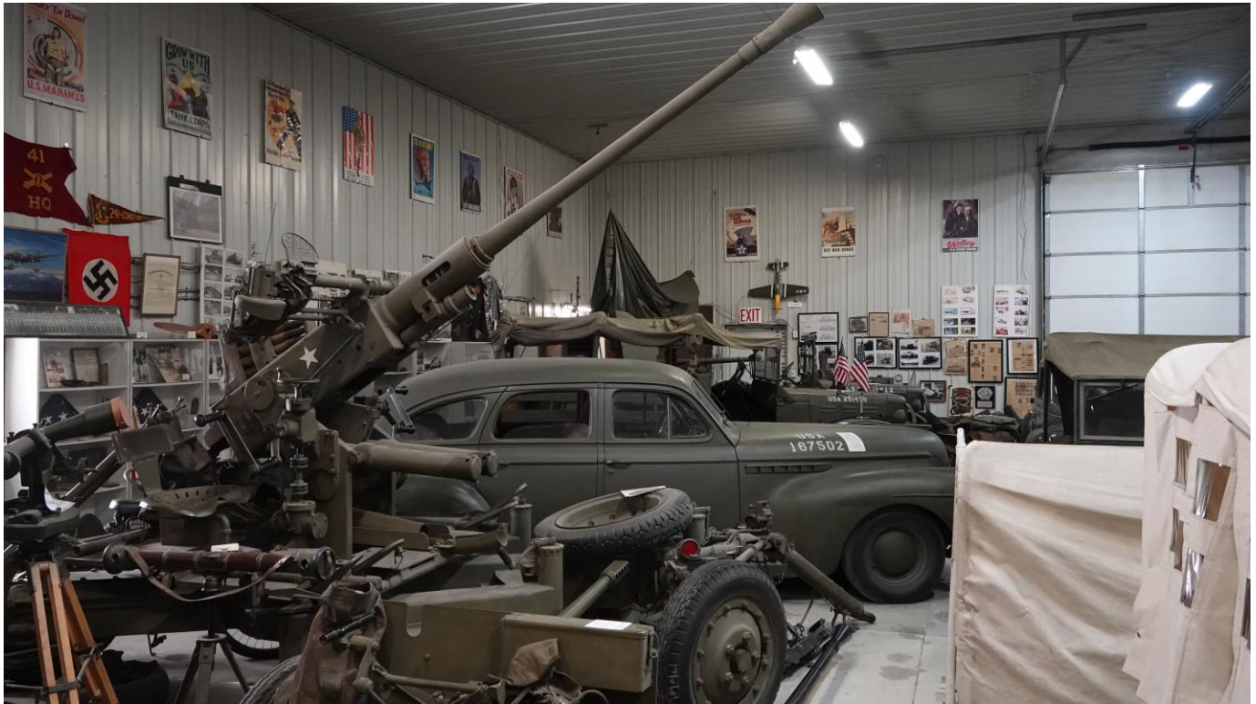
May 2021 Roberts Armory