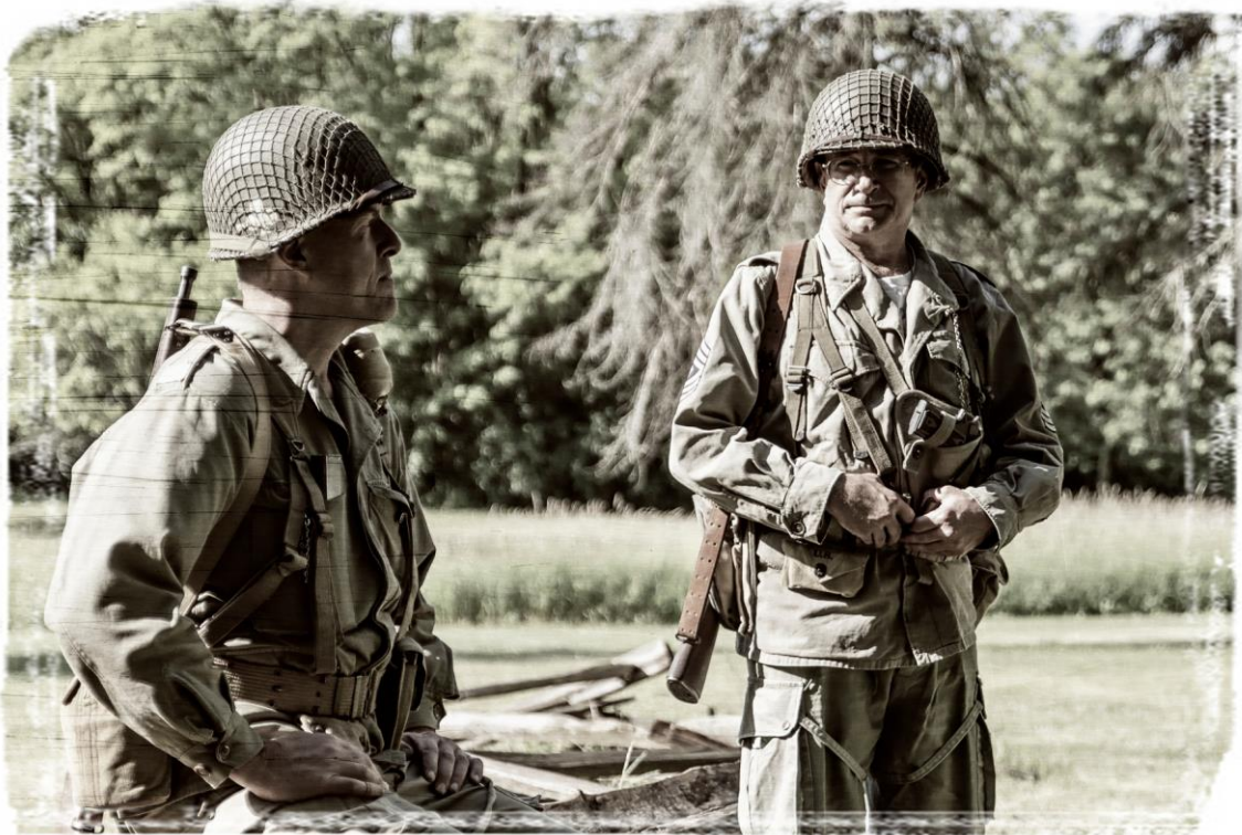
June 2021 Old Falls Village, Wisconsin