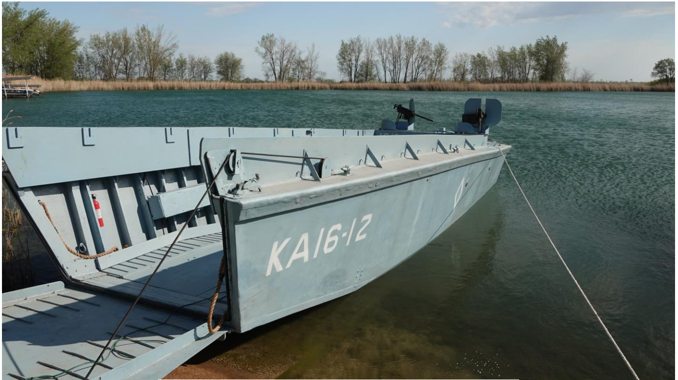
May 2021 Roberts Armory Rochelle Illinois